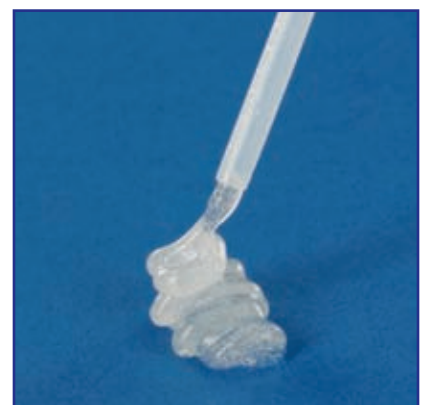
Injectable Stamberger Sinu-Foam (RR 650)